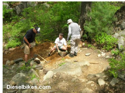
The Trail Crew Hard at Work