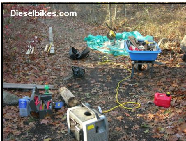
Tons of Tools!