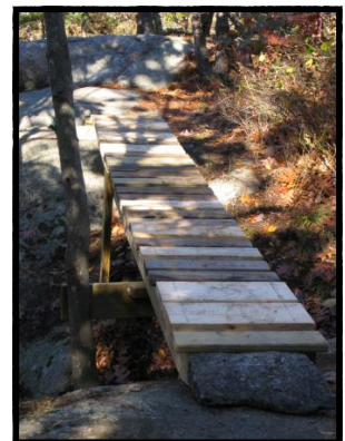
New Bridge build by other local Mountain Bikers