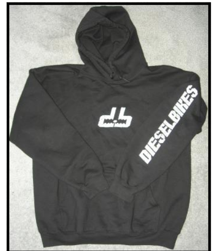
New Hooded Pull-Over $30.00 each (Free Shipping)

Check out this product and other apparel items on our website or by clicking this link . Remember, monies collected go right back to the trails we support.