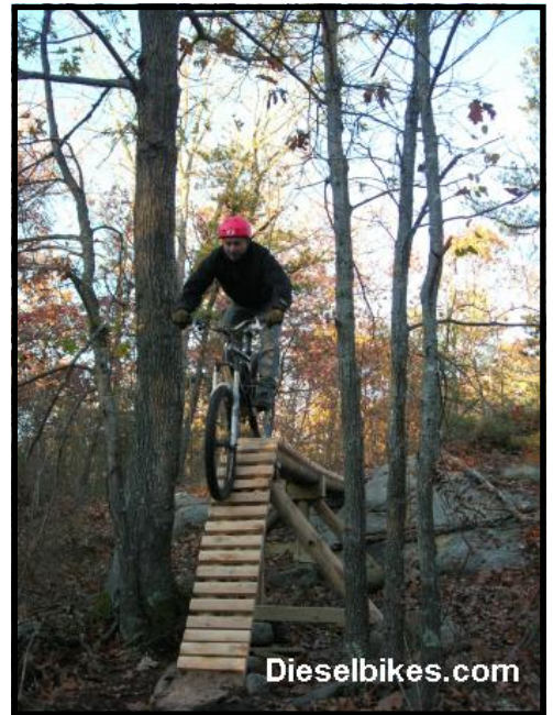
Bruce testing it out!