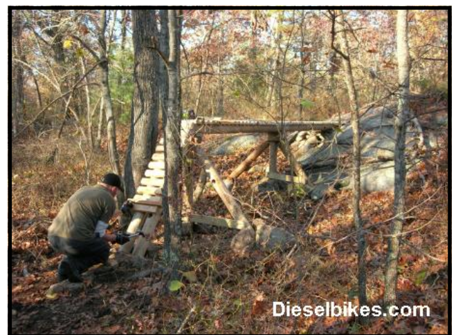
Nailing in the last few pieces