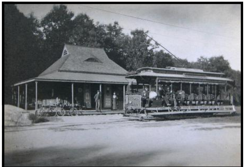
Photo Caption: Great Woods Trolley Station. Owned and operated by the B.R.B. & L. Railroad. Photo taken in 1892

Click here to read the rest of this article